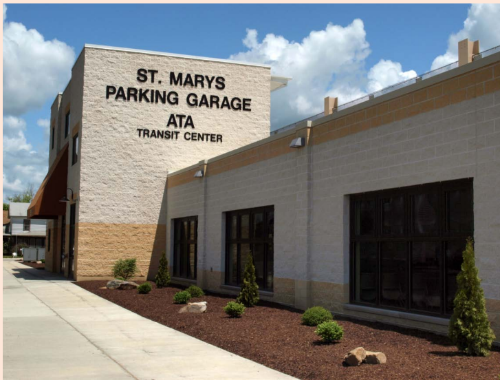
ATA TRANSIT CENTER - ST. MARYS PA